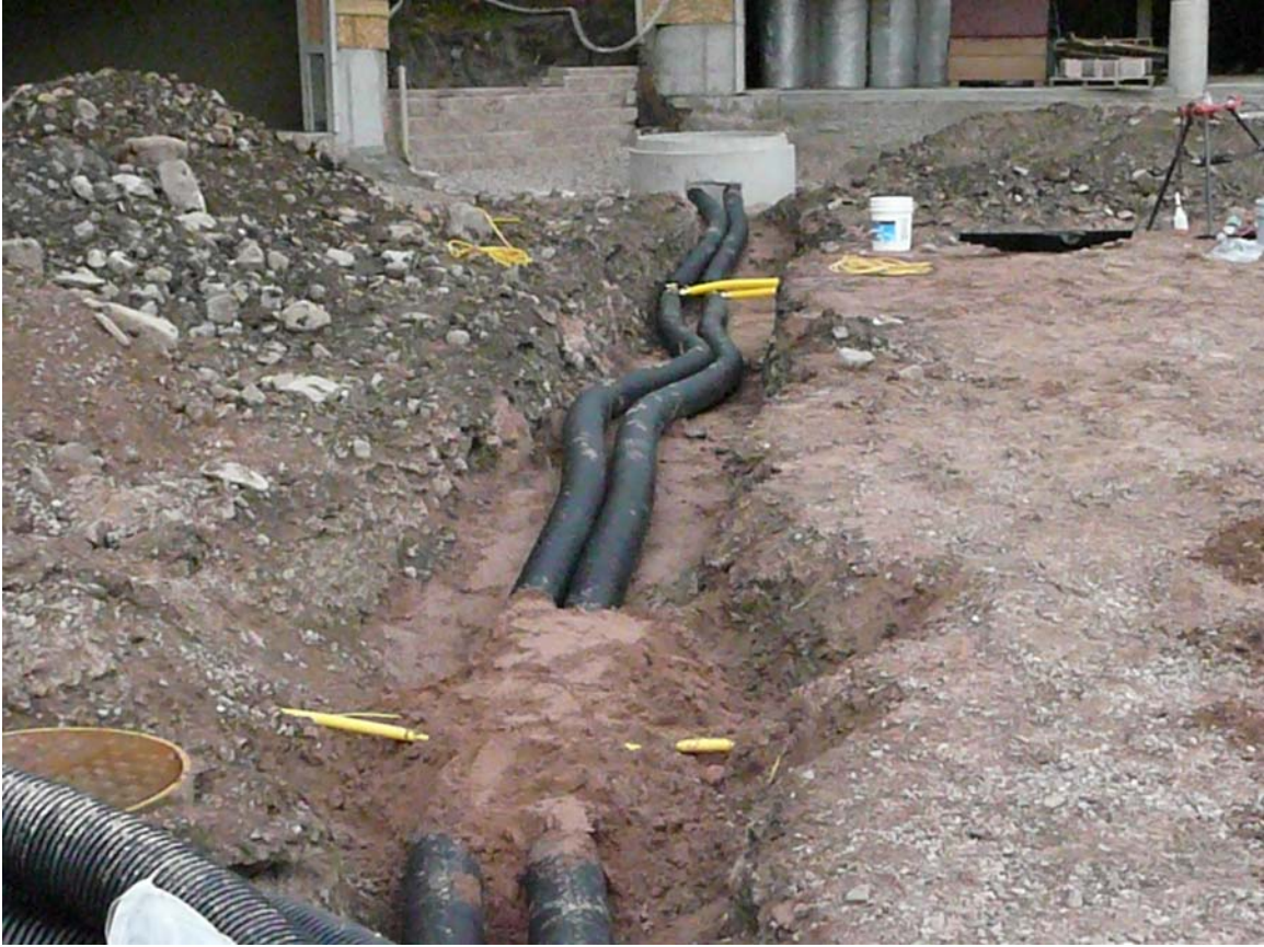
Laying snow melt pipe in road base