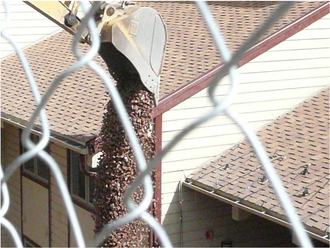
Dropping landscape stone over wall between wall base and lower buildings