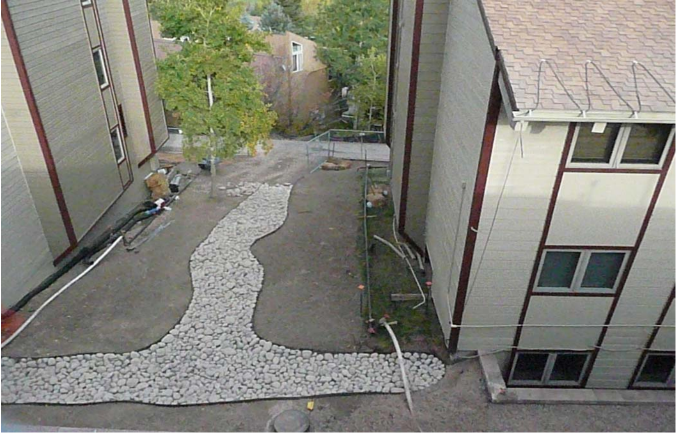
Rip rap rock drainage landscape left of your condo