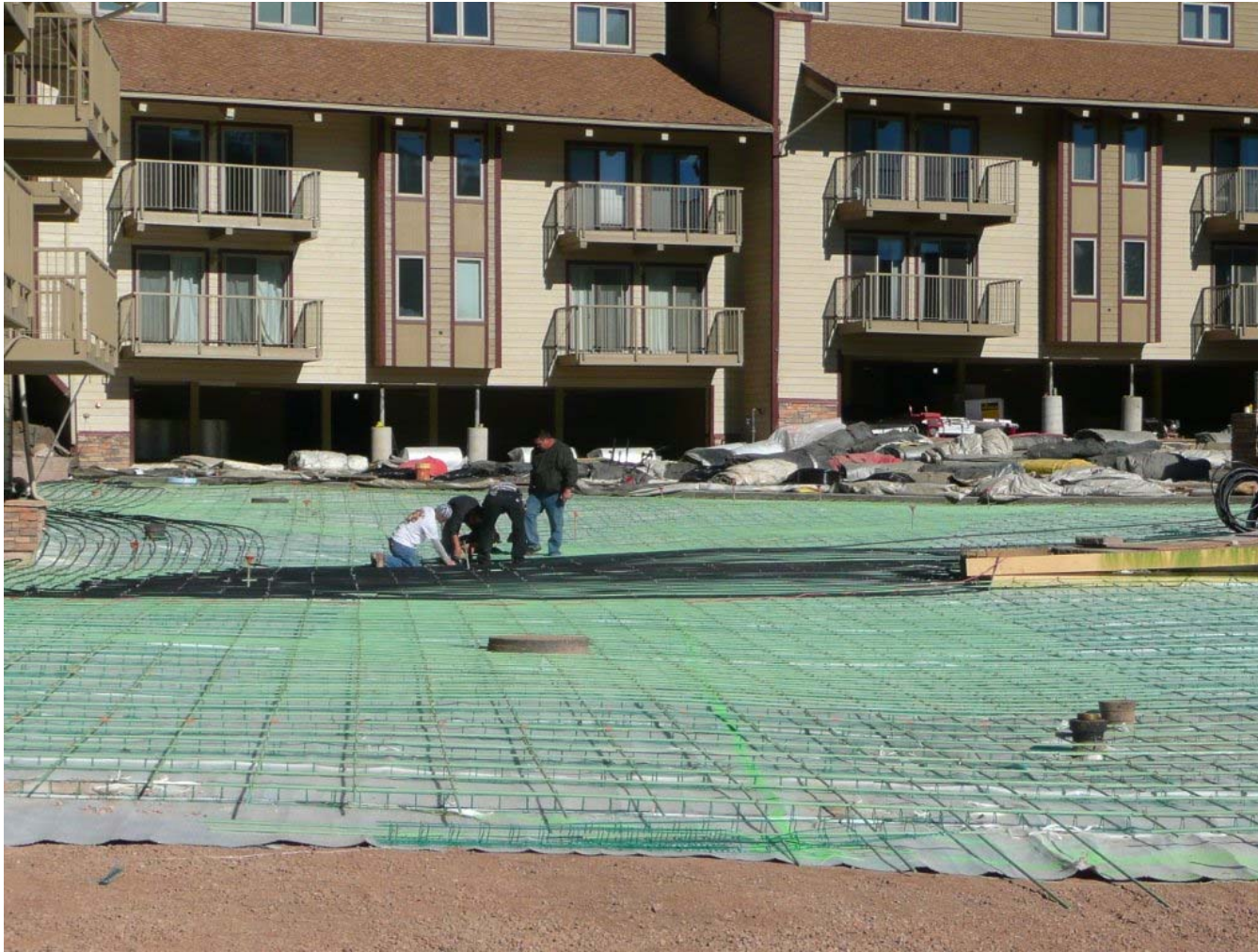
Insulating Base between Road Base and Snow Melt