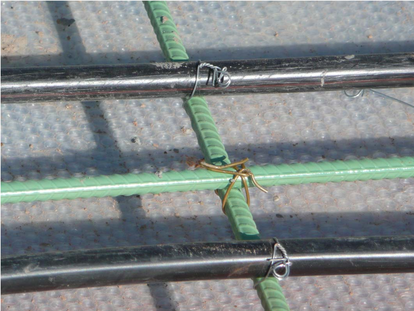
6 Miles of Piping to Heat Snowmelt (black)