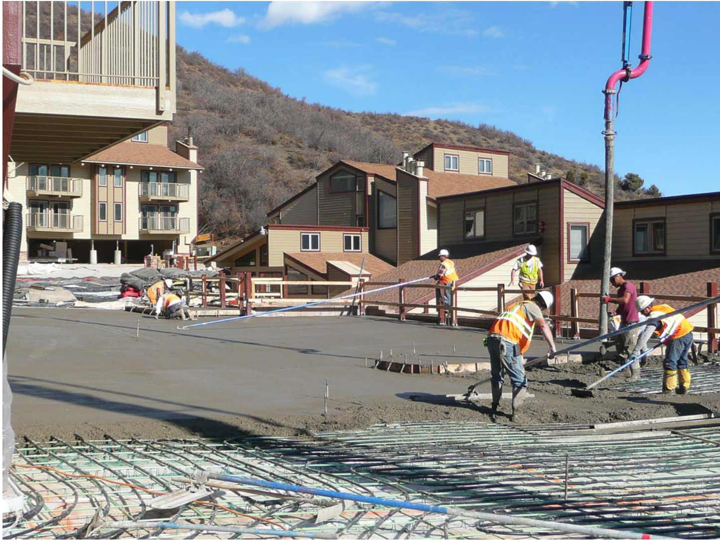
Pouring Cement for Section 2 of 5