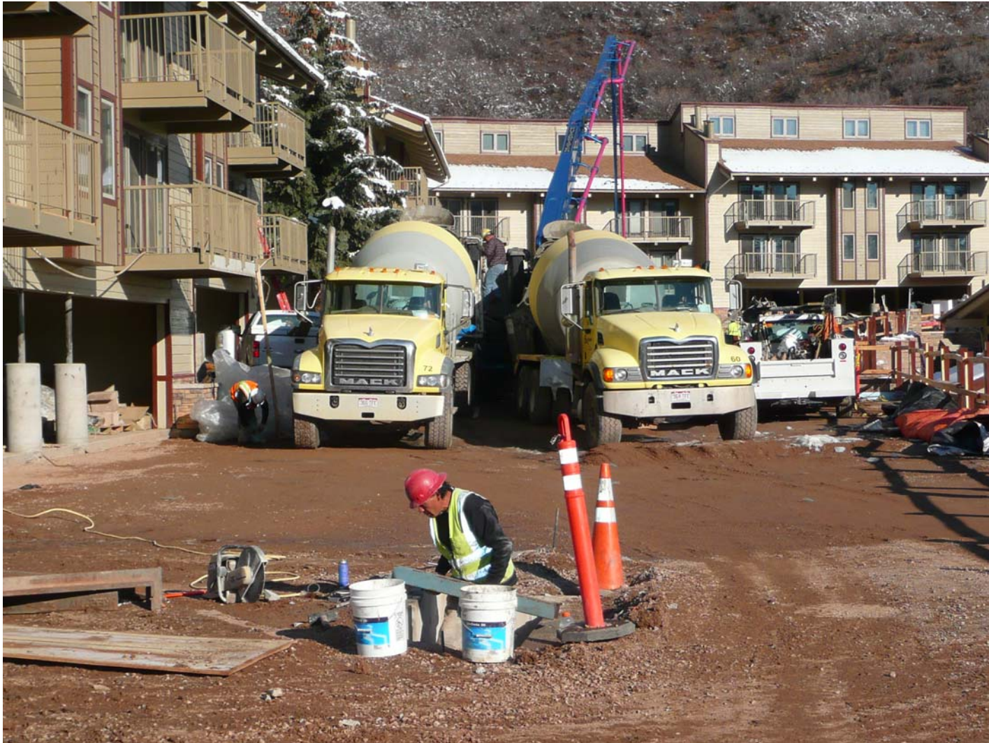
Cement Delivery, Two Trucks Feeding Cement Pump